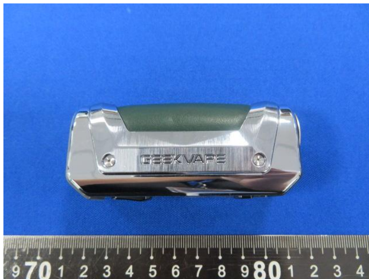
Geekvape S100 MOD (AEGIS SOLO 2 MOD)